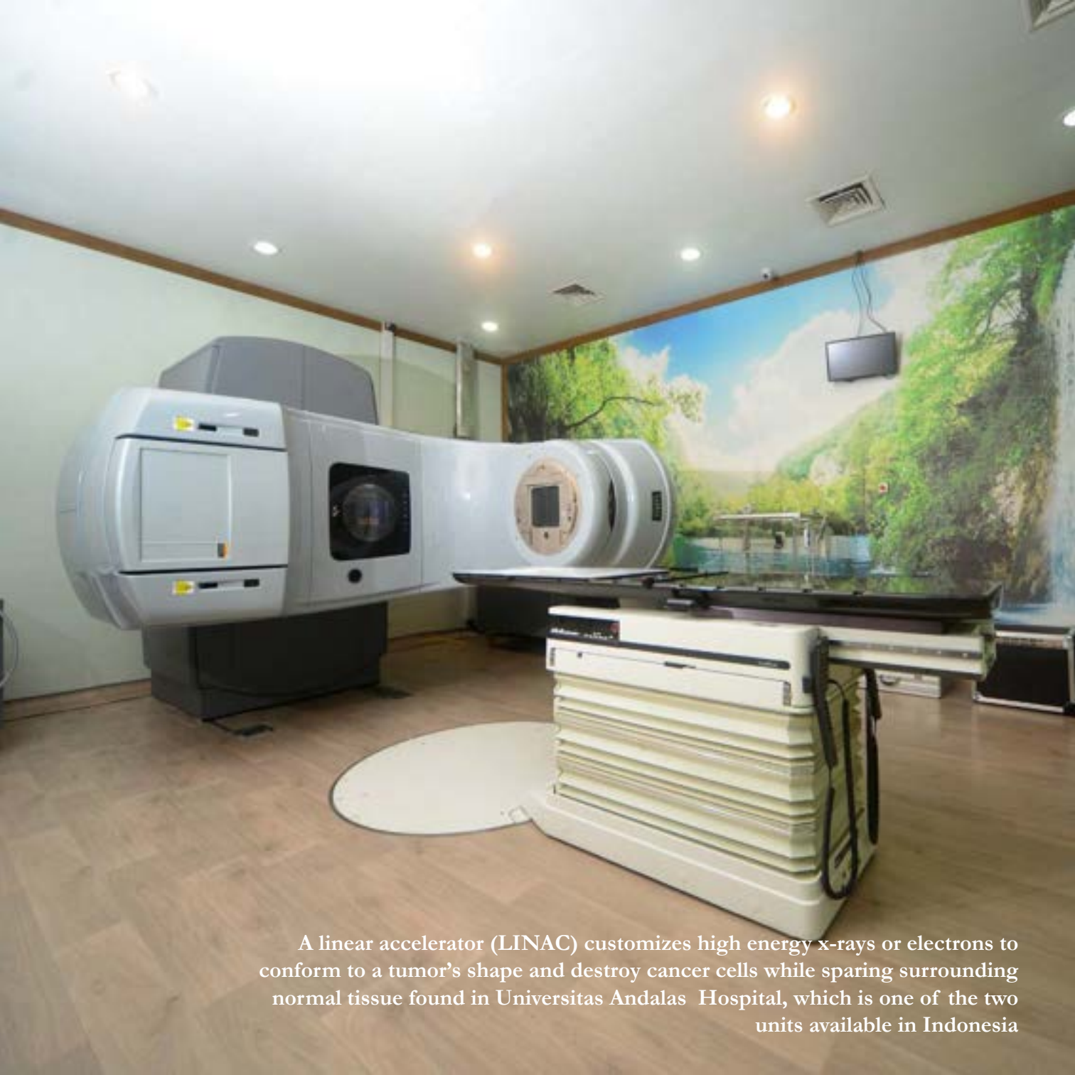
A linear accelerator (LINAC) customizes high energy x-rays or electrons to conform to a tumor's shape and destroy cancer cells while sparing surrounding normal tissue found in Universitas Andalas Hospital, which is one of the two units available in Indonesia